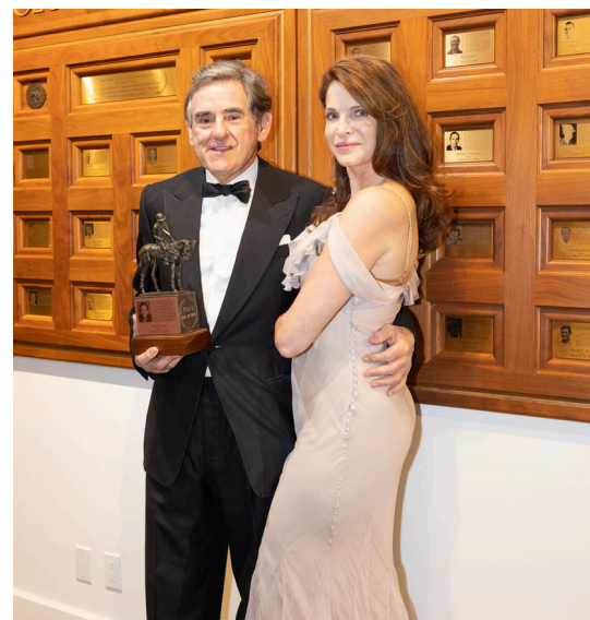
Peter Brant and wife Stephanie Seymour

Peter Brant established the powerhouse White Birch organization, setting a new standard of excellence in American high-goal polo for more than thirty-five years beginning in 1979. His leadership and vision elevated the competitive landscape and encouraged other teams to develop and maintain fully professional operations that shaped the modern era. White Birch captured thirty-one tournaments rated at twenty-six goals or higher, including twelve USPA Gold Cup titles, five World Cup crowns, seven International Opens, five C.V. Whitney Cups, and five Monty Waterbury victories. Their dominance culminated in winning the 2005 U.S. Open. As a player, Brant achieved a seven-goal handicap, ranking among the highest-rated amateurs in modern polo history.